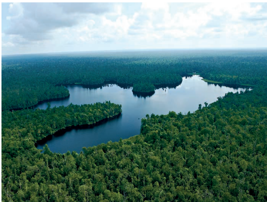
Peatland Forest on the Kampar Peninsula, Sumatra

Case studies are available at globalagribusinessalliance.com