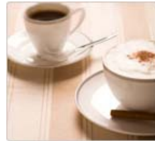
Rainforest Alliance coffee

As a result of these efforts, Asiana Airlines has won numerous awards and accolades, including the 2001 designation by the Korean Ministry of Environment as the first environmentally friendly company within the service industry; the 2006 environmental distinction for its maintenance facilities at Incheon International Airport; and the 2008 Presidential Award of the National Environmental Management Grand Prix for the company's energy savings and CO 2 reduction activities, most notably the introduction of Korea's first carbon offset program, improvements in route operations procedures and aircraft engine washing, and providing on-board Rainforest Alliance coffee.